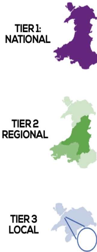
Diagram 1: The Tiers of Development Plans in Wales and General Conformity