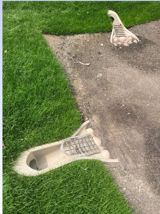
Swale Inlet and Rain Garden