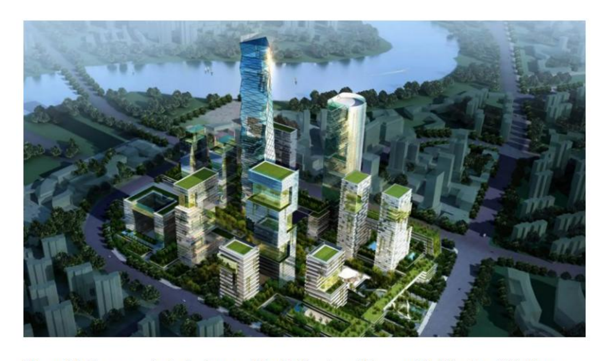
The world's biggest eco-city in development, Tianjin Eco-city will be around half the size of Manhattan.